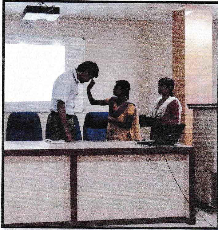
FELICITATION OF THE SPEAKER